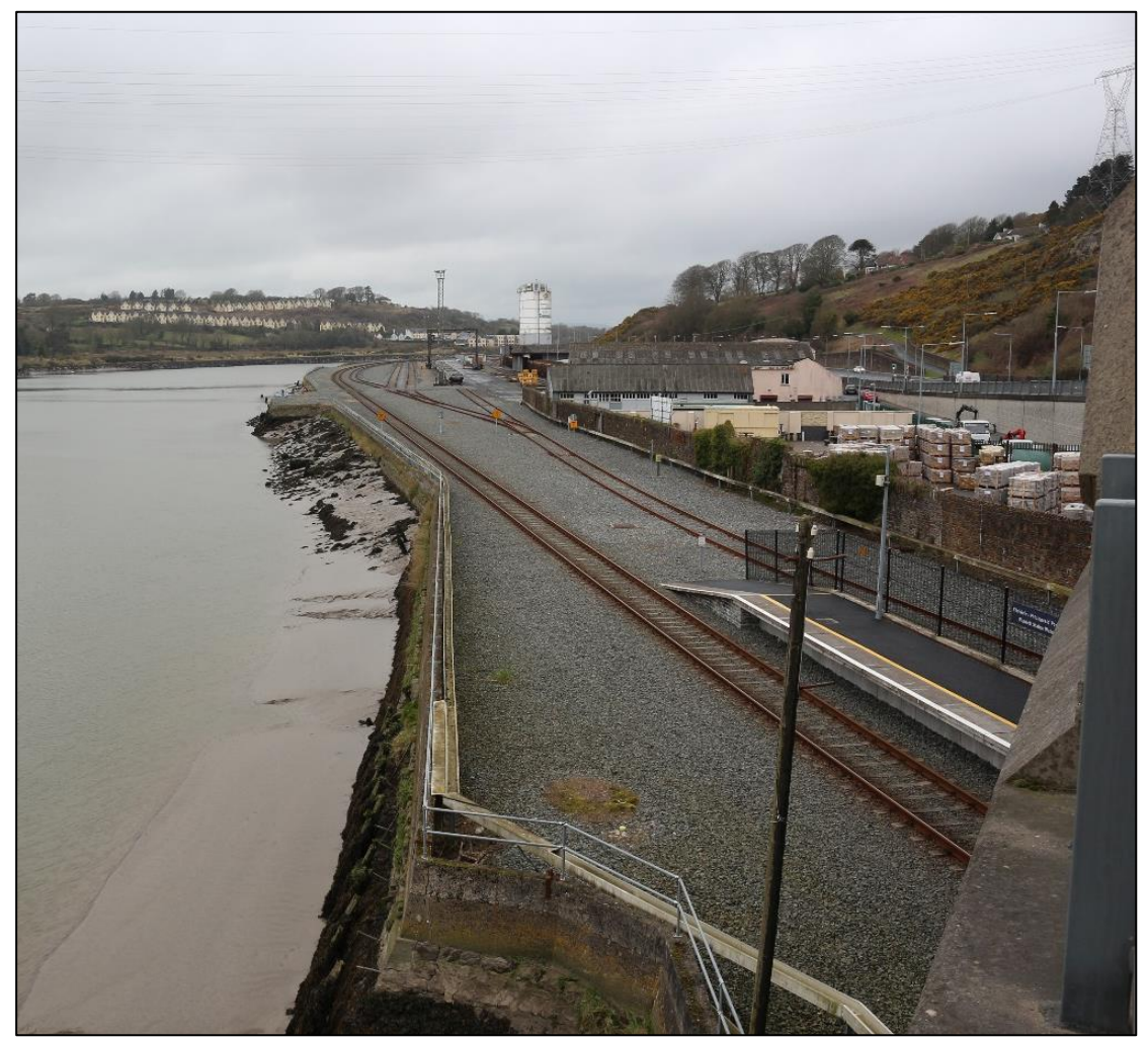
Plate 8.1 View of a receiving environment.

as is the surficial deposit of Made Ground (rail ballast) on landside and cohesive alluvium in mudflats. The photograph was taken by G-NET 3D in March 2021 from Terminus Street overbridge (at approx. Ch.360, see Figures 4.1 to 4.6 in Volume 3 for chainage reference points) looking westwards.